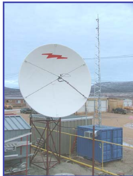
Satellite Dish & Wireless Antenna, Qikiqtarjuaq, Nunavut

Every Nunavut community has a trained CSP to provide local support and assist in administration. 20% of the QINIQ customer revenue is allocated to the CSPs. Eighteen of the 21 CSP companies involved are Inuit-owned.